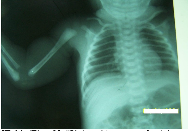
[Table/Fig 2] "Plain skiagram of right arm" showing shaft tissue constriction without involvement of humerus.