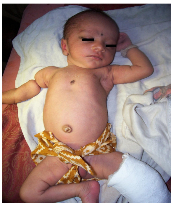
[Table/Fig 1] "Clinical photograph of patient" showing shaft tissue constriction mark at right arm and CTEV left side.

Tel.: 91-755 – 4050571 (R), 4050261 (O); e-mail: drrajendrak1@rediffmail.com